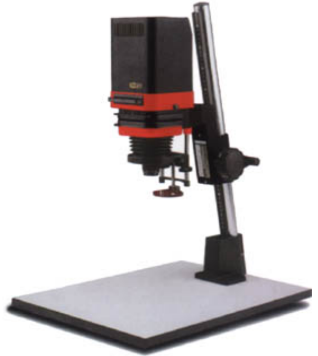
Paragon 35mm enlarger

Larger Prints by swinging head for wall or floor projection.