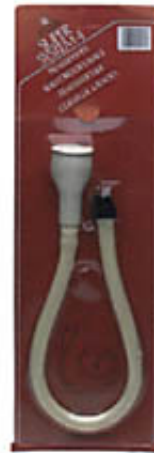
Force Film Washer